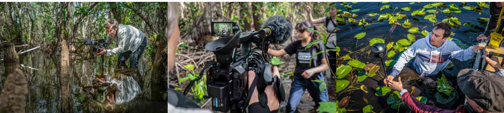
Photo Exhibit: An installation that includes photographs of the Everglades that challenge viewers to consider their own mediated relationship with the swamp.